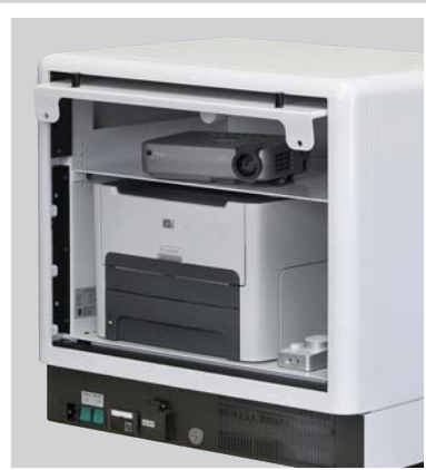
PARADIDACT Printer and projector storage

PARAT introduces a new Mac-look PARADIDACT® mobile IT lab for schools and universities that use Apple MacBooks.